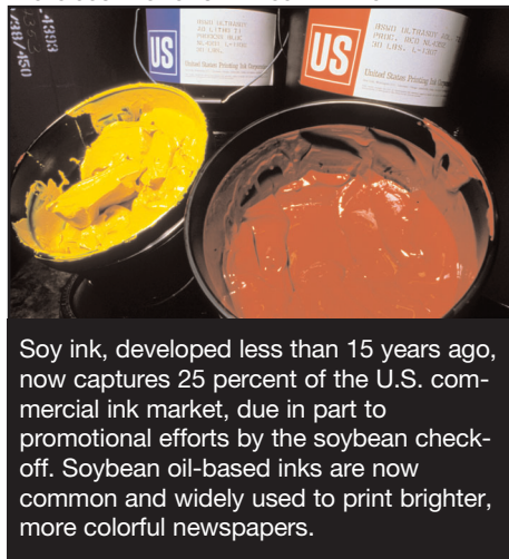
Soy ink, developed less than 15 years ago, now captures 25 percent of the U.S. commercial ink market, due in part to promotional efforts by the soybean checkoff. Soybean oil-based inks are now common and widely used to print brighter, more colorful newspapers.